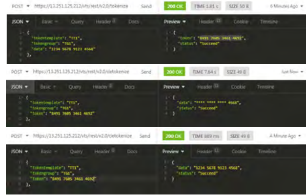
Image above shows the different tokenization stages